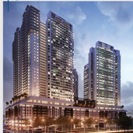
KL Traders Square @ Setapak