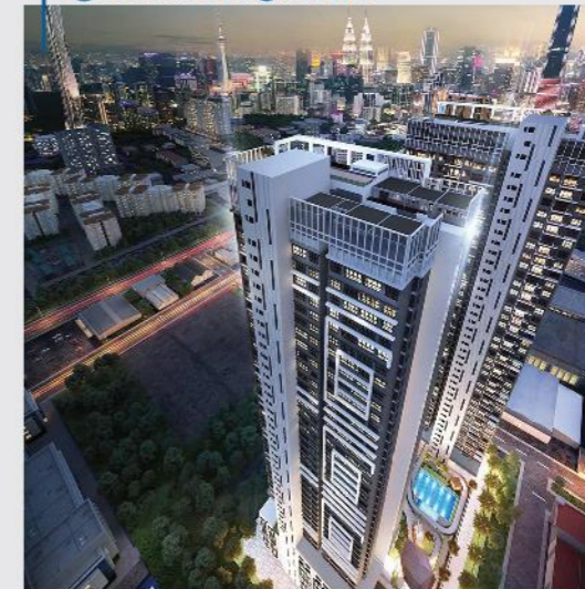
Trion 2 @ Jalan Sungai Besi