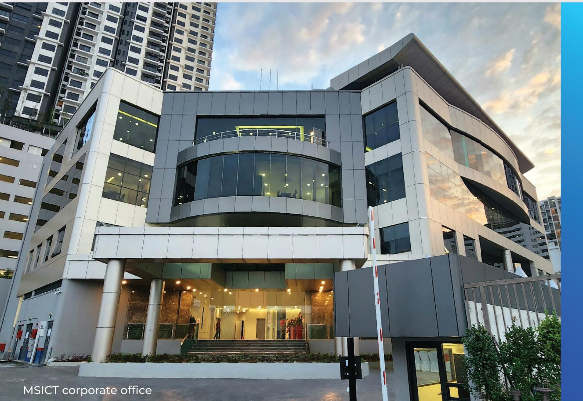
MSICT corporate office