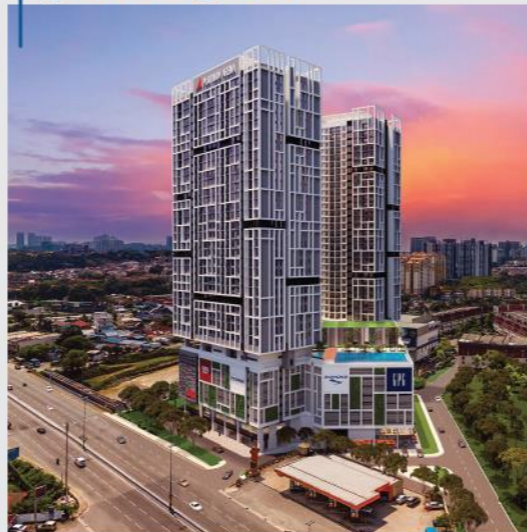
Platinum Arena @ Old Klang Road